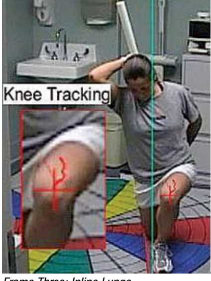
Frame Three: Inline Lunge

front of the cameras, athletes learn what proper movement feels like, and their sound technique carries over to sport-specific drills.