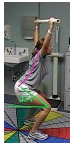
Frame Two: Deep Squat