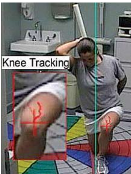
Frame Three: Inline Lunge

front of the cameras, athletes learn what proper movement feels like, and their sound technique carries over to sport-specific drills.