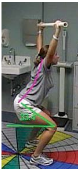
Frame Two: Deep Squat